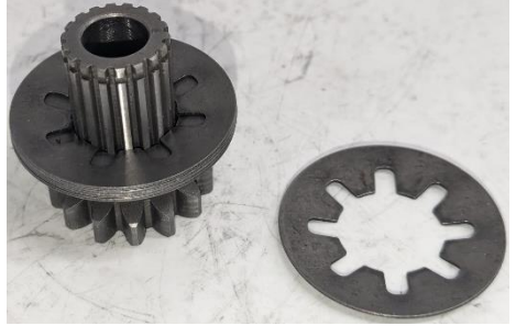
Remove one of the washers from the shaft so there is now a total of 4 and use the new circlip supplied with our ring gear.

Remove the circlip from the original starter clutch. We used a spanner in the vice for compression.